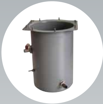
NSF Approved Tank Coating: anti-stick, scale and lime, anti-bacterial.