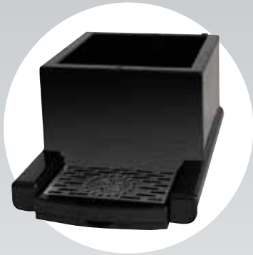
Waste Bin with magnetic sensing tech and removable drip tray.