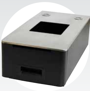
Companion riser increasing capacity by 100+ spent pods.